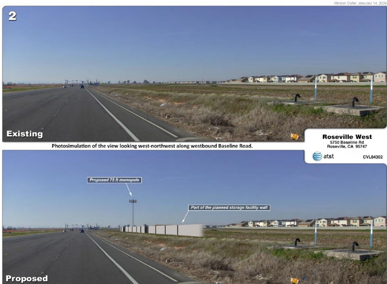
Figure 3: Photosims

c) The project site is in an urban setting, and as a result lacks any prominent or high-quality natural features which could be negatively impacted by development (see Figure 3 below). The project site itself is located a minimum of 350 feet from the closest adjacent residentially zoned property line. The City of Roseville has adopted Community Design Guidelines (CDG) for the purpose of creating building and community designs which are a visual asset to the community. The CDG includes guidelines for building design, site design and landscape design, which will result in a project that enhances the existing urban visual environment. The project does not conflict with applicable zoning and other regulations governing scenic quality. Accordingly, the aesthetic impacts of the project are less than significant.